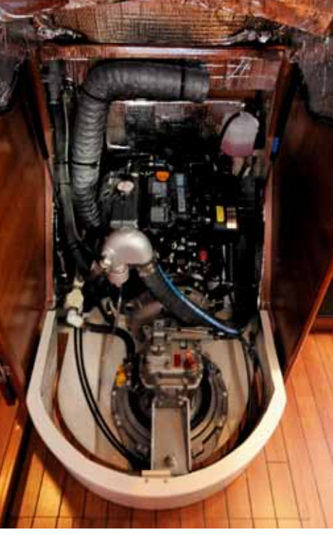
The targa arch (top) is great for adding a bimini as well as keeping the traveller out of the cockpit. Test boat had the optional 29hp Yanmar (above).

shaftdrive e36. Engine noise and vibration were both commendably low.